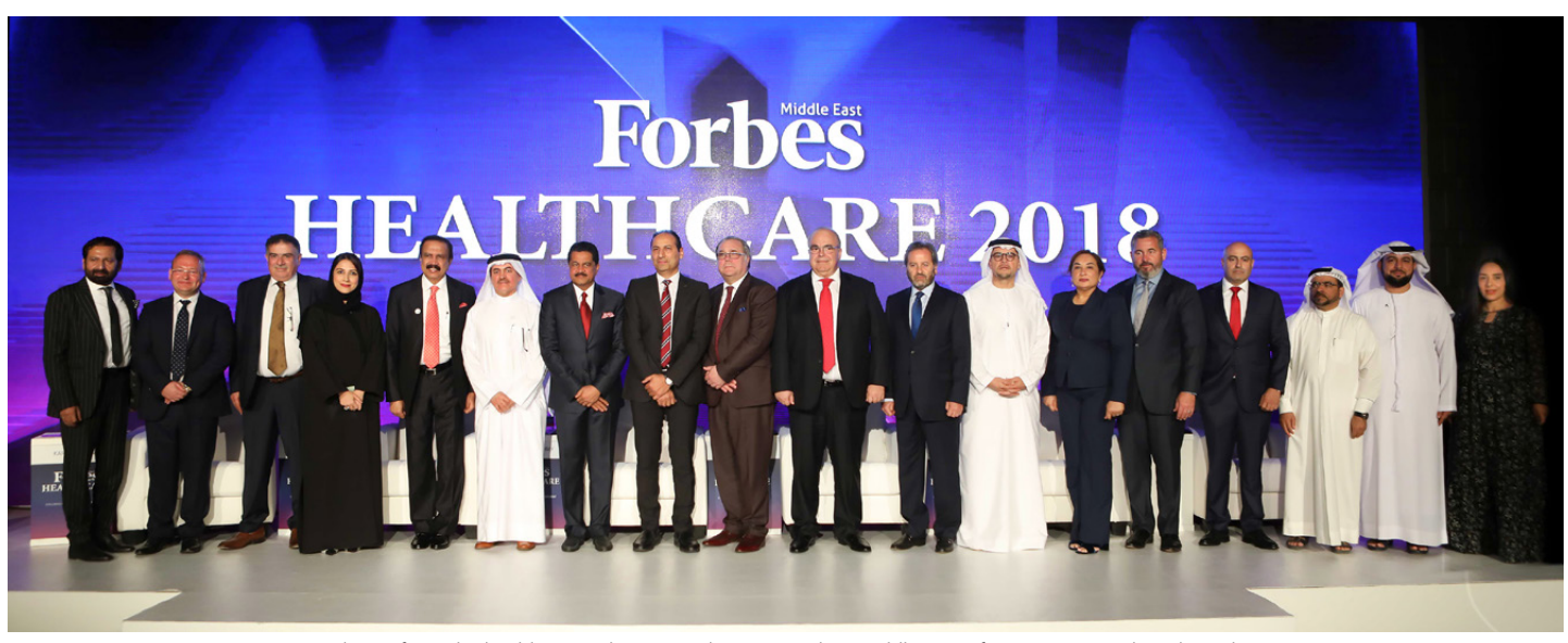
Key players from the healthcare industries took part in Forbes Middle East's first event to explore the industry