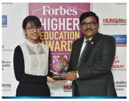
Outstanding Support for Students - Manipal Academy of Higher Education, Dubai Campus