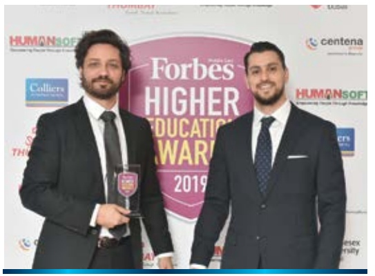
Best Use of Big Data - Luminus Technical University College