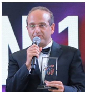
His Excellency Raed Khoury, Minister of Trade and Economy in Lebanon and Founder of Cedrus Bank