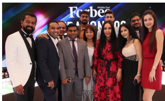
Forbes Middle East team