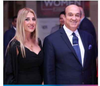
Cluster General Manager, Roda Hotels & Resorts