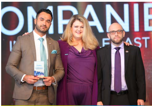
Team MAG Lifestyle