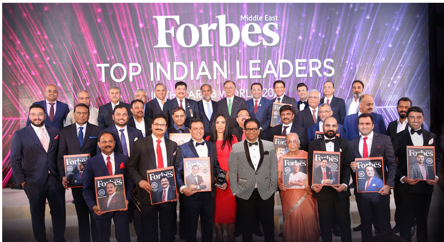
The Top Indian Leaders in The Arab World 2018 Awardees.