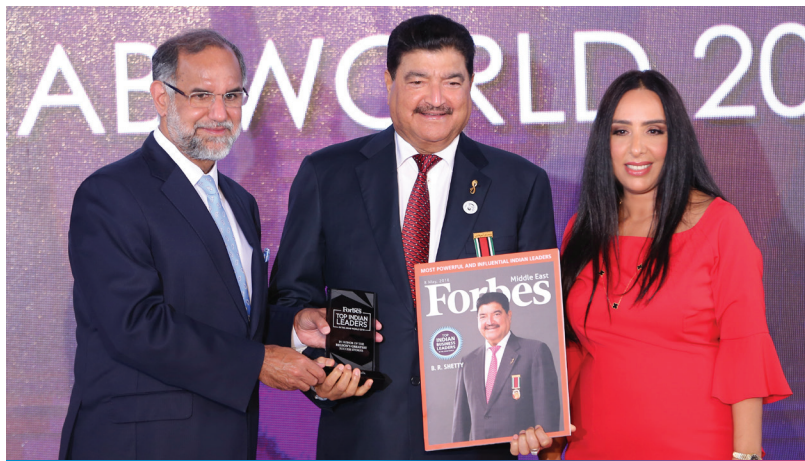
Dr. B. R. Shetty, Founder and Chairman of BRS Ventures / NMC Health