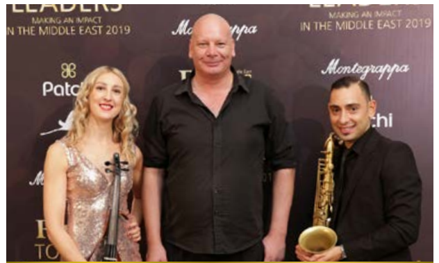
Entertainment by Vento Entertainment