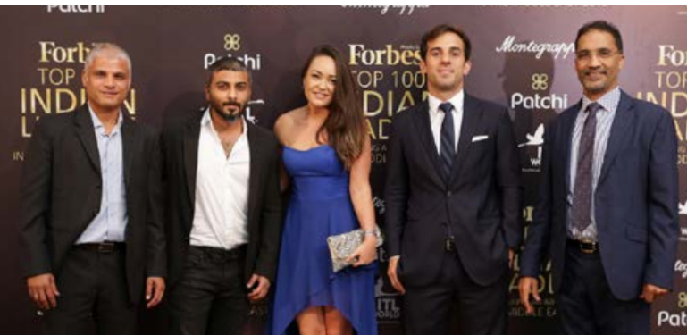
The team from Montegrappa